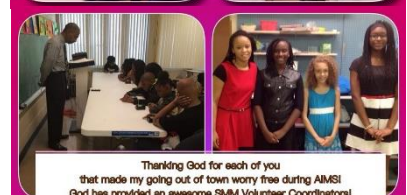
Thanking God for each of you that made my going out of town worry free during AIMS! God has provided an awesome SMM Volunteer Coordinators! You were great! Compliments from the host Pastor as well! Thank you, Thank you, Thank each of you!